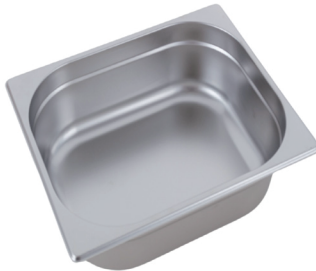
SP124 1/2 Size 4"Depth