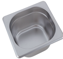
SP164 1/6 Size 4"Depth