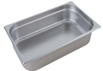
SP114 Full Size 4"Depth