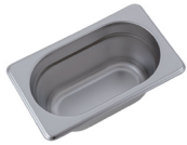
SP194 1/9 Size 4"Depth