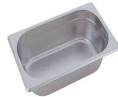
SP144 1/4 Size 4"Depth