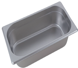
SP134 1/3 Size 4"Depth